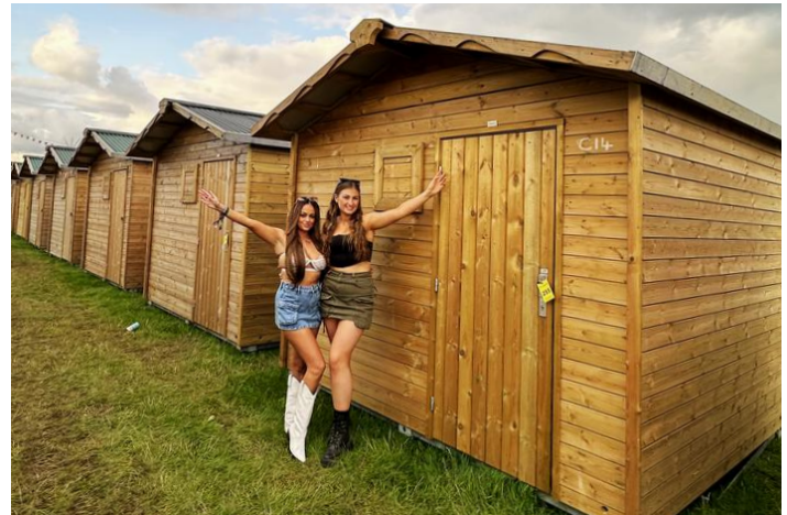
Ref: Outside of our Festihut village at Creamfields 2023

Your guests can now simply turn up and enjoy a comfortable camping experience in one of our Festihuts - leaving more time to see all of their favourite bands!